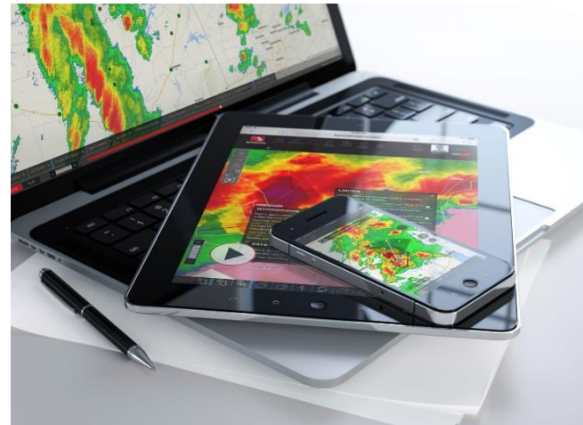
Baron Threat Net is compatible with computers, tablets, and mobile devices.

Patented processing techniques automatically analyze radar data and pinpoint threats, so business continuity planners can focus attention and resources during severe weather events. Pinpoint alerting sends alert notifications via text message, push notification, and email when weather approaches specific locations of interest. High-resolution forecast models for precipitation, temperature, and rain or snow accumulation help prepare for expected conditions up to four days in advance. Once the storm arrives, radar and current condition reports enable users to evaluate the impact of the event as it unfolds, and make any adjustments to their response plan.